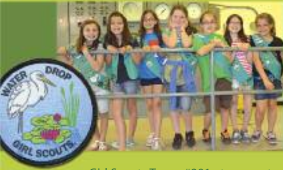
Girl Scouts Troop #291 at a recent tour of Plant #14 on Cuba Hill Road.